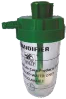
O 2 Concentrator