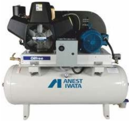
Oil free Air Compressor with tank