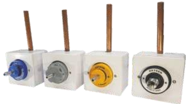
Double Locking Outlets