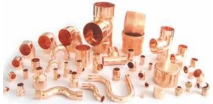
Copper Pipe Fittings