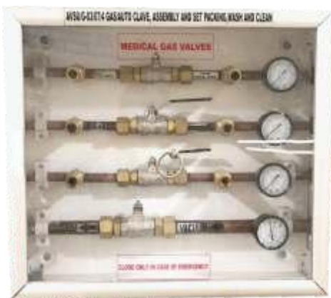
Zonal Ball Valve