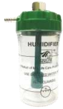
Nut on Type