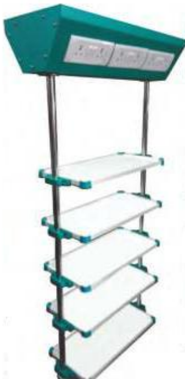
Endoscopy / Lap