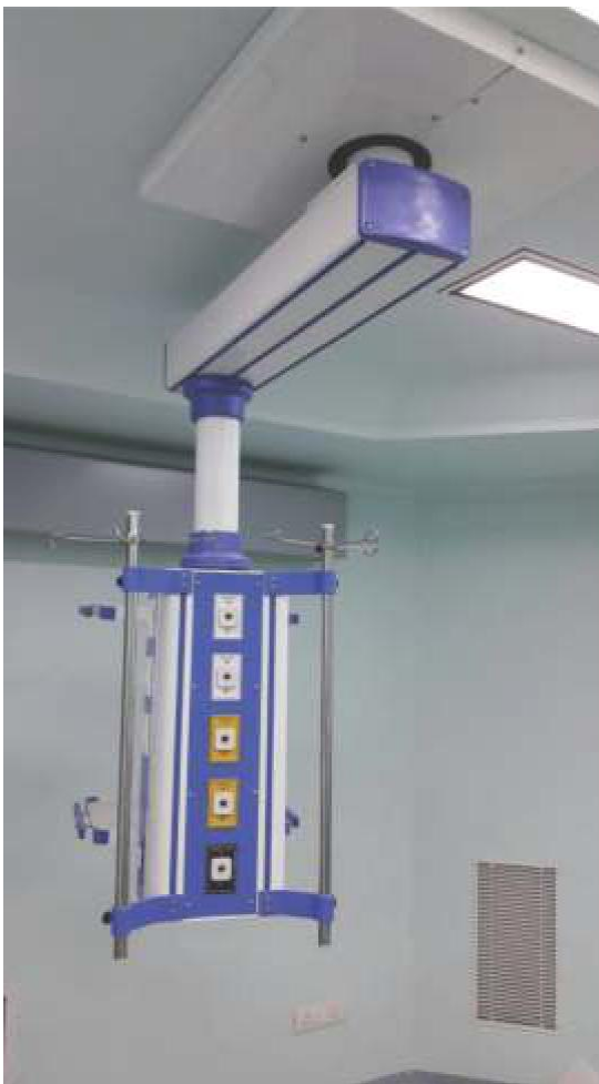
Single Arm Pendant