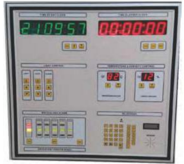
Operation Theatre Control panel