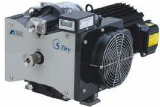
Oil Free Vacuum Pump