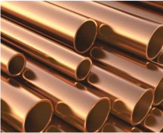
Medical Copper Pipe